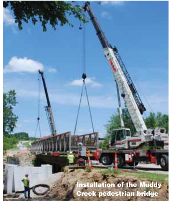
Installation of the Muddy Creek pedestrian bridge

This project features flood walls and improvements to the Wetlands Park including elevated walkways, stone walkways, water cascade, comfort station, and interpretive signage between the Marriott Hotel and Conference Center and the Iowa River. Construction has begun on the flood walls and the elevated walkway is being fabricated. Phase 1 construction, including the elevated wetland walkway and water cascade, is scheduled for December 2010 completion; Phase 2 construction of the comfort station, paved trail, and Wetlands Park planting is scheduled for August 2011 completion.