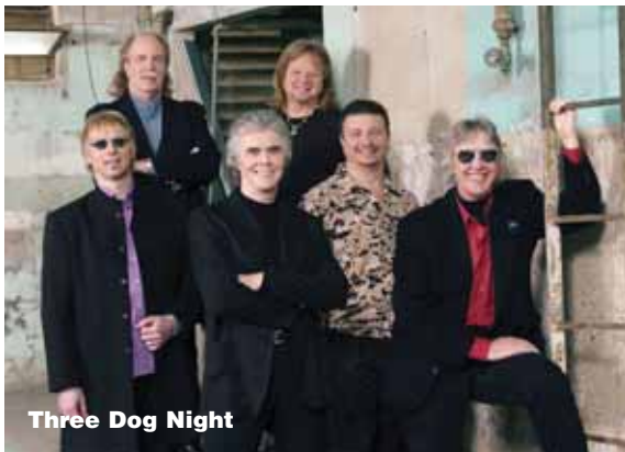
Three Dog Night

Advance tickets are available through September 2 for $10, and $15 the day of the show, at Coralville City Hall, Coral Ridge Mall Guest Welcome Center, the Iowa City/Coralville Area Convention and Visitors Bureau, and at www.fryfest.com . Admission is free for children age five and under; coolers are prohibited on the concert grounds. Making the concert truly a community event, all proceeds from the concert and beverage garden benefit Coralville's free 4thFEST celebrations.